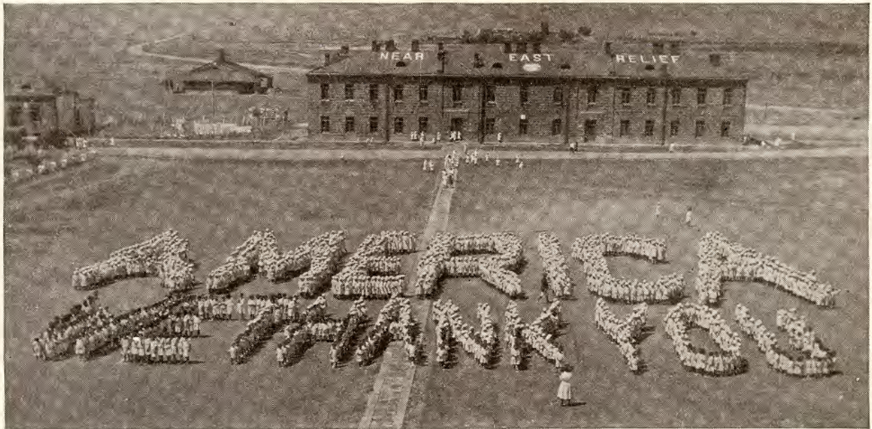
An American contribution to world peace—thousands of happy, wholesome children as future leaders for the hate-ridden Near East. Twenty-five hundred in the Orphan City of 12,000 at Alexandropol express their thanks for American aid.