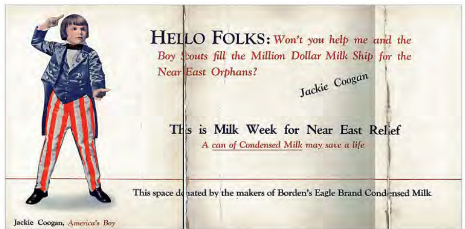
Photo 10. Jackie Coogan campaign brochure, 1924

Jackie Coogan was a popular child star in Hollywood, having appeared in many films, including Charlie Chaplin's 1921 silent movie "The Kid." In 1924 Jackie's parents allowed their ten-year old son to work with Near East Relief on a project called the "Children's Crusade." The goal was to raise one million dollars worth of food for orphans in the Middle East. Jackie toured the United States by train. Newspapers, movie magazines, and news-reels followed his travels and publicized the campaign on a