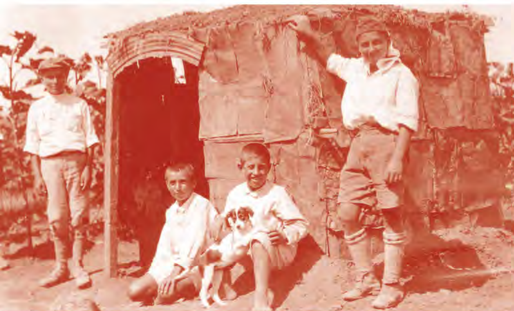
Photo 9. Boys at the orphanage in Syra, Greece, built their own small houses, c. 1923

Although thousands died of illness and disease at refugee camps and on ships bound for Greece, Admiral Bristol reported that without the actions of Near East Relief another 100,000 refugees would have died.