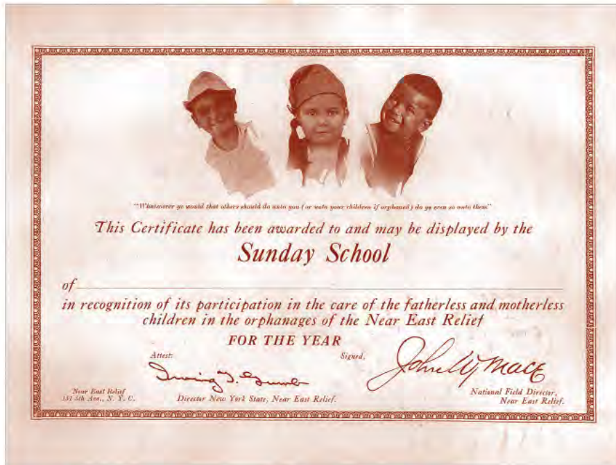
Photo 4. Near East Relief Sunday school certificate, 1924

By October 1915, the Committee had sent $100,000 to Ambassador Morgenthau. These funds were distributed throughout the Ottoman Empire to American diplomats, medical personnel, and missionaries. The Committee used existing missionary schools and other buildings as relief centers, hospitals, and orphanages. Missionaries who had returned home from Anatolia often spoke at meetings, rallies, and other fundraising events.