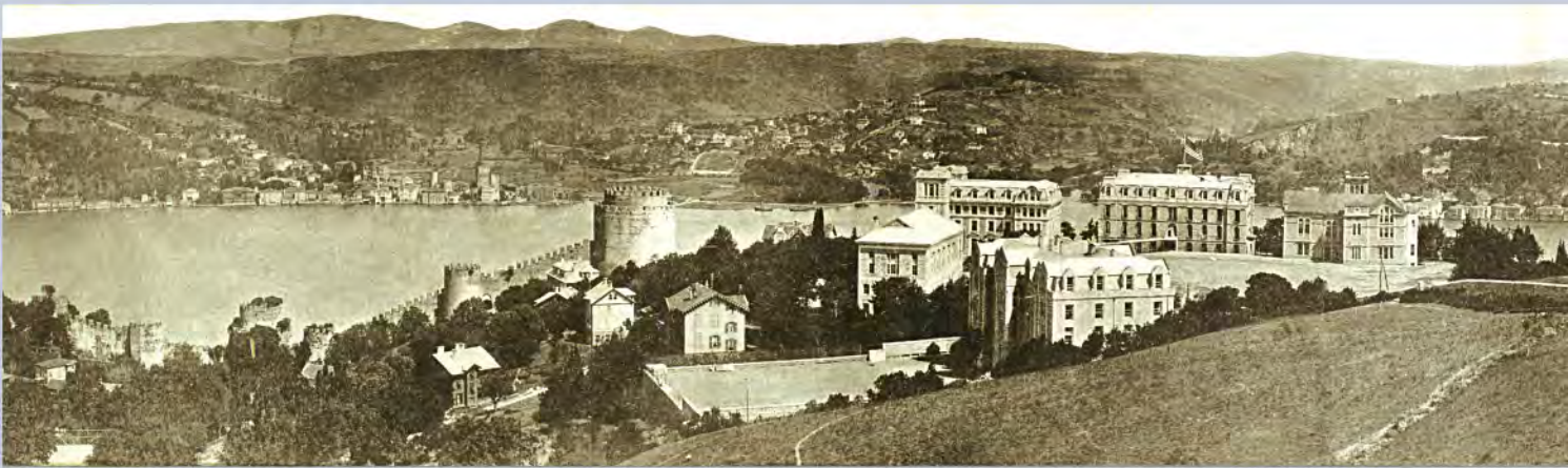
Photo 7. Robert College on the Bosphorus, Constantinople, 1880.

O n April 6, 1917, the U.S. declared war on Germany. Many Americans also called for war against the Ottoman Empire, Germany's ally. The Senate seemed to favor a second declaration. Former President Theodore Roosevelt was a vocal supporter, famously stating that "the Armenian massacre was the greatest crime of the war, and failure to act against Turkey is to condone it." 4