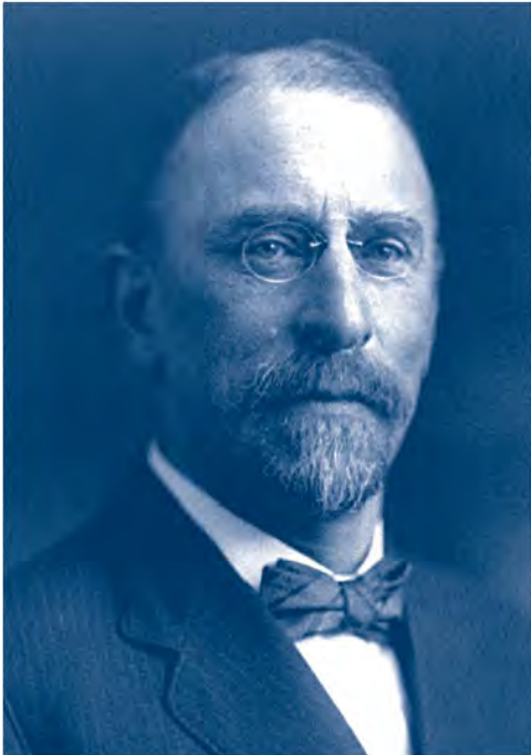
Photo 1. Henry Morgenthau, U.S. Ambassador to the Ottoman Empire, c. 1913.