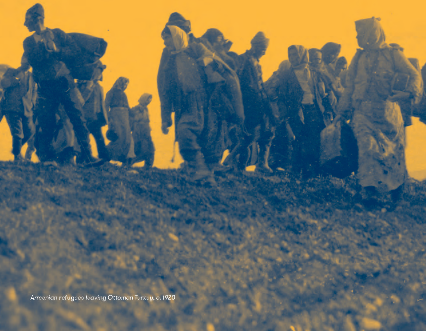
Armenian refugees leaving Ottoman Turkey, c. 1920

—Ambassador Morgenthau in a telegram to the Secretary of State, July 16, 1915