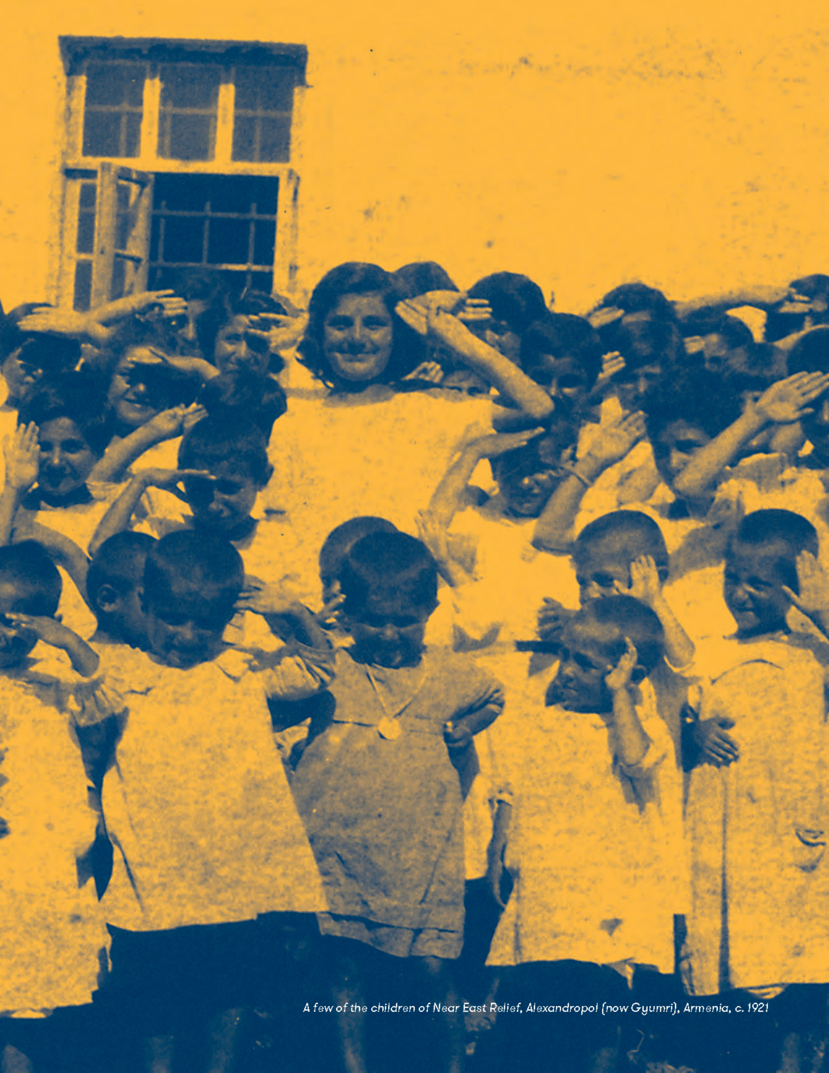
A few of the children of Near East Relief, Alexandropol (now Gyumri), Armenia, c. 1921