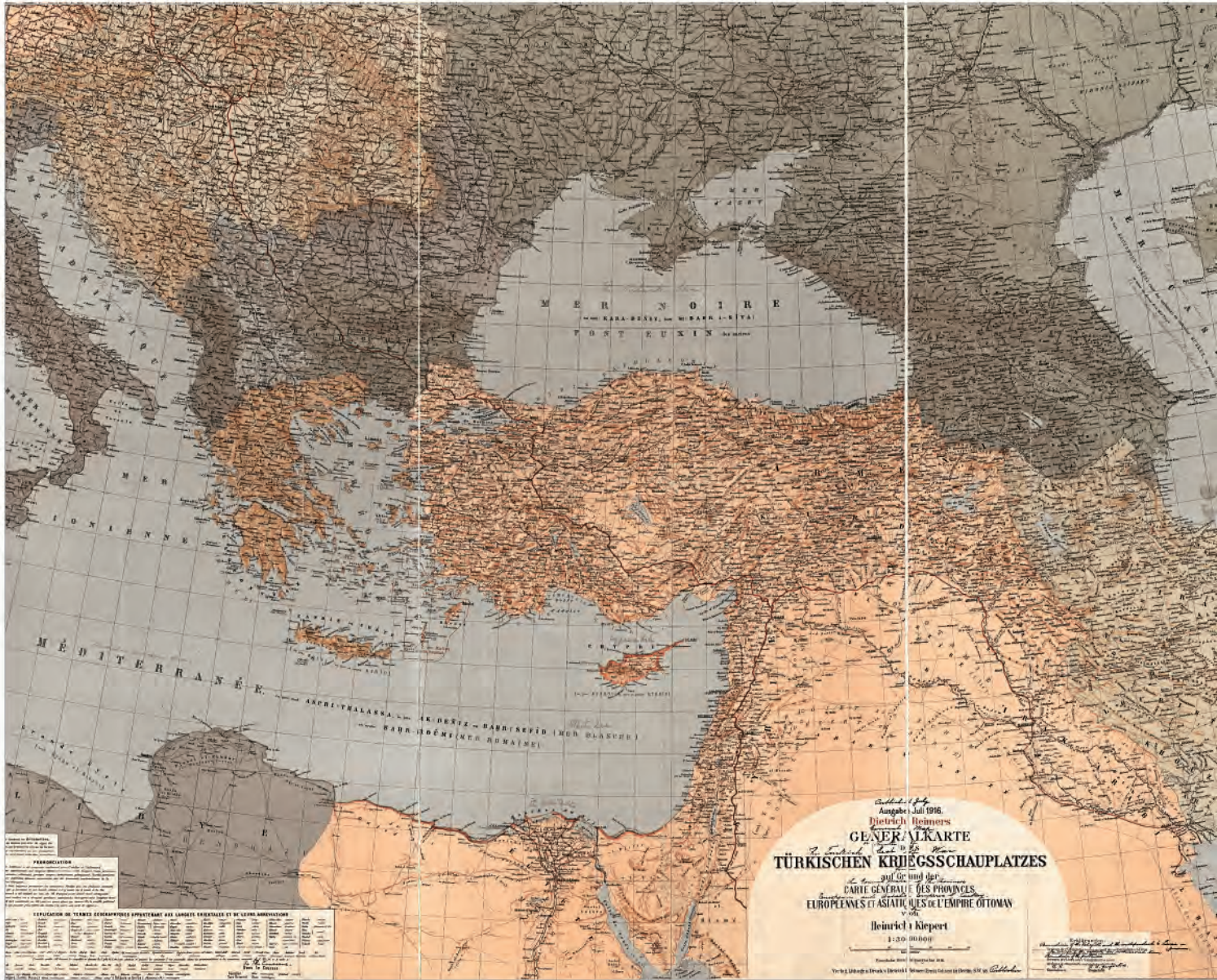
Map 1. Ottoman Empire, 1916.