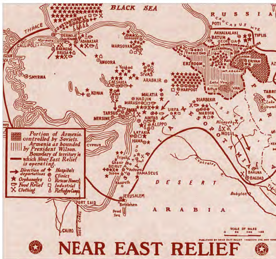
Map 2. Locations of Near East Relief stations, 1921

contagious eye disease. Most children had to be treated for severe malnutrition before they could be allowed to eat normal meals. Near East Relief also created special clinics to treat children for emotional trauma.