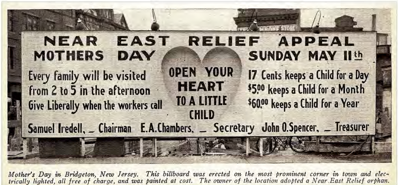
Photo 5. Mother's Day banner, New Jersey, 1924

dying of starvation, having nothing to eat but grass.